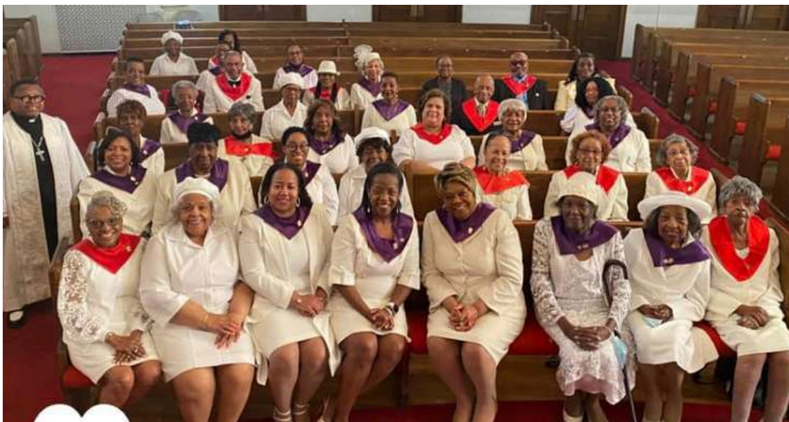
The Missionaries of St. Paul wore their stoles and communed together in honor of Emma Clarissa Clement Day.

The Women's Home and Overseas Missionary Society aims to promote understanding of God's plan through Jesus Christ, teach Christian missions, exemplify Christian principles, promote World Evangelism, and provide financial support for the mission outreach of the A.M.E. Zion Church.