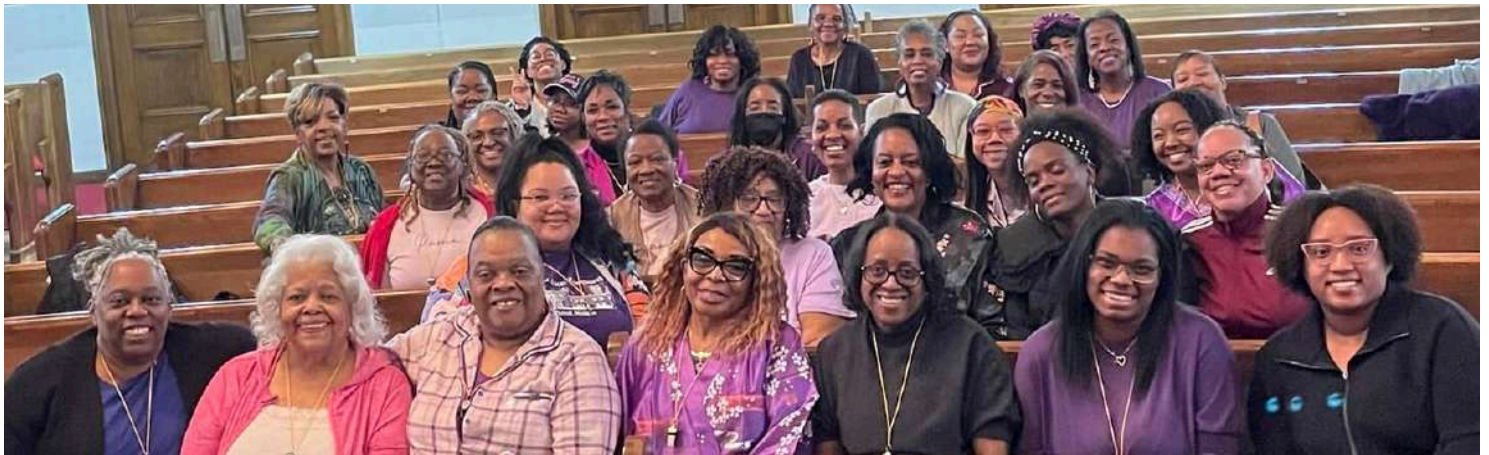
The ladies of St. Paul were all smiles as they celebrated sisterhood, donning their purple pajamas and casual wear.