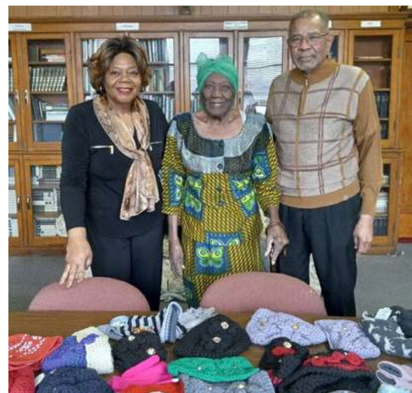
St. Paul Missionaries Bureau of Supply led the Hat & Gloves initiative to provide for those in need.

Learn more about the WH&OMS by clicking HERE